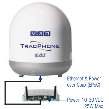
TracPhone V30 Antenna and VSAT-Hub